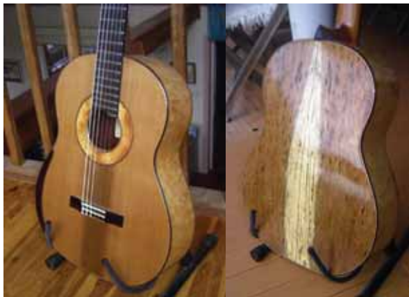
Right: This Cedar/Queensland Maple Grange has a shorter 630mm string length. Decoration Silky Oak.